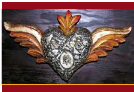
Sacred Heart with Milagros

Every day numerous customers ask what influenced us to decorate the restaurant the way we did.