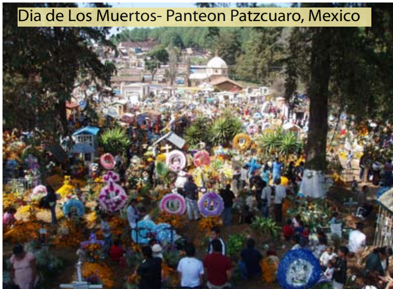
Dia de Los Muertos- Panteon Patzcuaro, Mexico

Sunday November 2nd- Screening of Diaz de los Muertos video and last chance to view the beautiful Dia de los Muertos Displays.